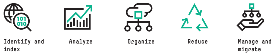
Figure 1. The five stages of legacy data clean-up

Legacy data clean-up is typically employed to optimize storage and system performance as well as reduce the cost of managing an increasing information footprint. Data clean-up also reduces risk by identifying sensitive information such as Personally Identifiable Information (PII), Personal Health Information (PHI), and Personal Credit Information (PCI) that may be unmanaged in enterprise systems. ROT data present in system repositories delivers no value but increases IT costs unnecessarily.