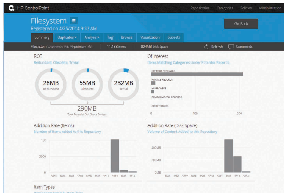
Figure 2. ControlPoint summary analysis dashboard

For organizations moving their information to the cloud, to prevent breaches of privacy or data sovereignty policy, HPE ControlPoint will help you identify and categorize information according to its business value and sensitivity. This allows you to make an informed decision on whether the information is suitable for a public or private cloud.