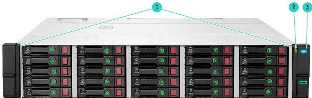
HPE D3710 Enclosure (SFF)

See the Windows Server Catalog for the latest supported configurations. Total support can grow as needed to up to 96 LFF drives or 200 SFF drives.