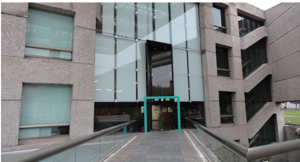
Customer Engagement Center

Mexico CEC contact: mexico.eg.presales@hpe.com