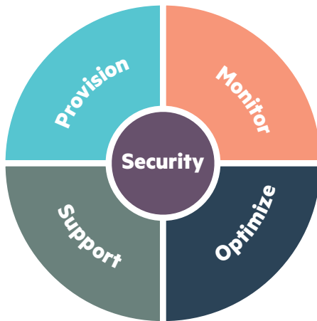
Figure 1. HPE iLO management—Core lifecycle management functions built in for instant availability