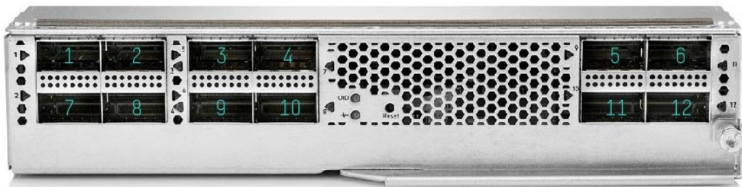
12 QSFP28 ports