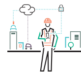
Put the IoT to work

Get what you need from HPE and Deloitte—solutions that help enable the most business agility and value from your IT: