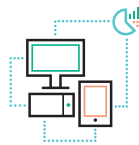
Modernize the IT infrastructure