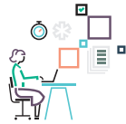
Derive more business value from IT

As you look ahead, what do you need to drive your business forward—faster?