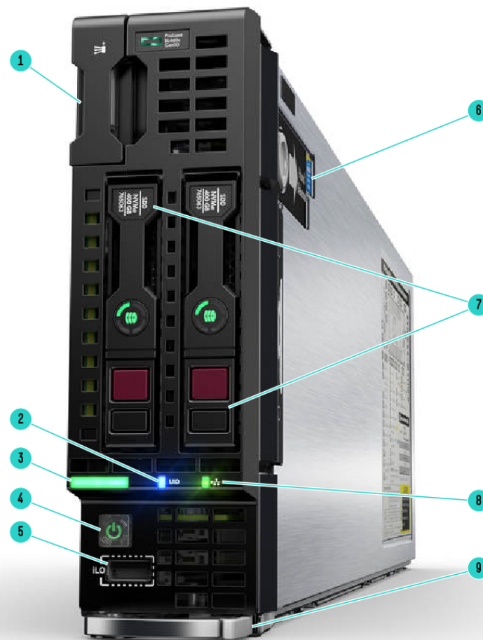
HPE ProLiant BL460c Gen10 Server Blade – Front View

Scale business performance and securely drive Traditional and Hybrid IT workloads across a converged infrastructure with the new HPE ProLiant BL460c Gen10 Server Blade for HPE BladeSystem. The HPE ProLiant BL460c Gen10 Server Blade helps drive new applications, turbo charge performance and transform into an agile, secure foundation, which with HPE OneView, places you on the path to Composable Infrastructure.