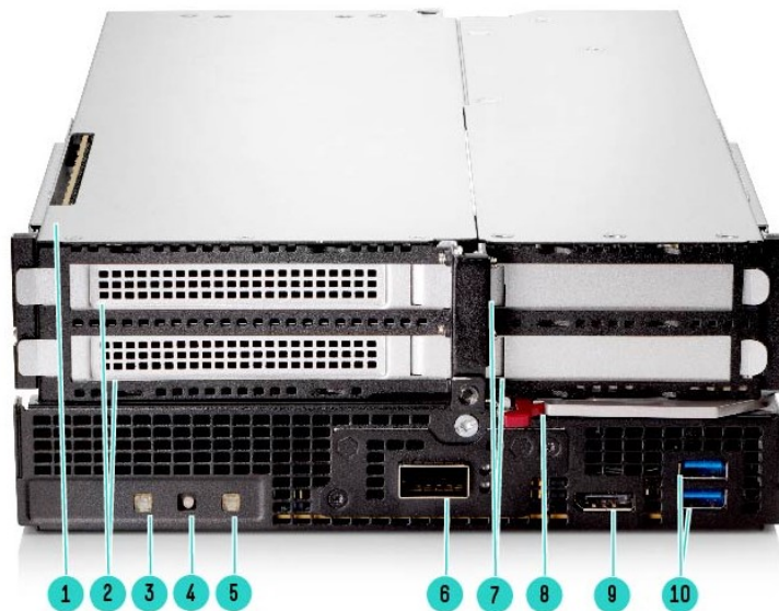
ProLiant e910 2U Blade Server - Front View