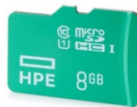
HPE 8GB microSD Flash Memory Card