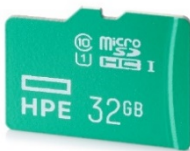
HPE 32GB microSD Flash Memory Card