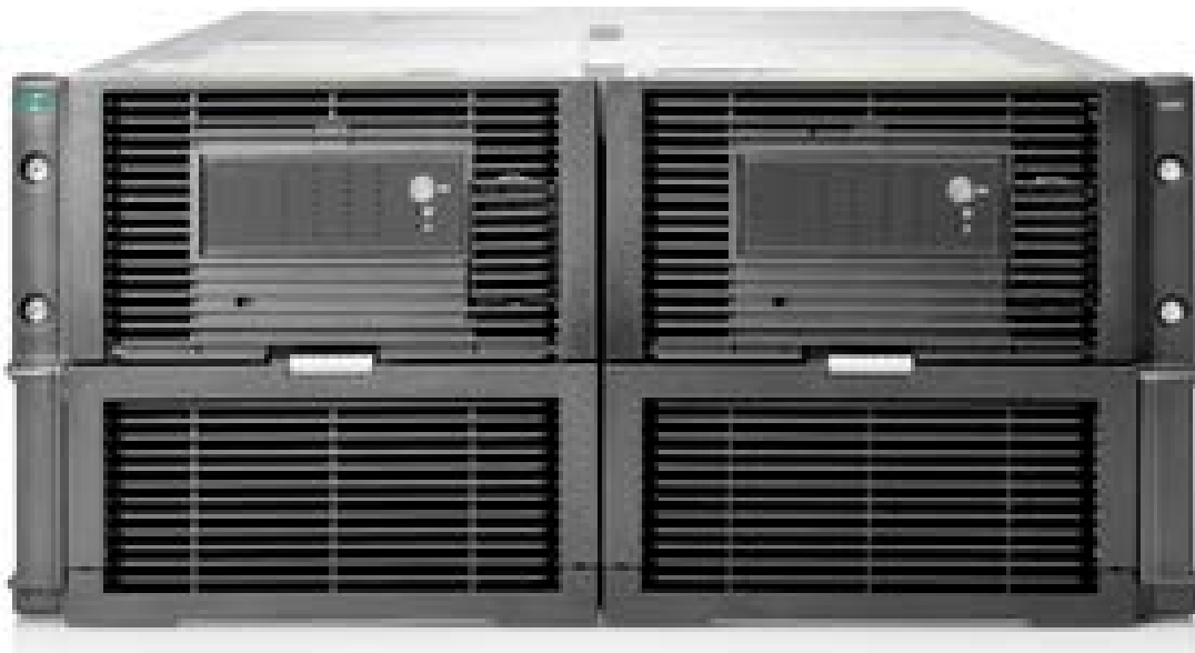
HPE D6020 Disk Enclosure –Front View

The HPE Apollo A4520 supports six (6) D6020 enclosures per A4520 (3 per node).